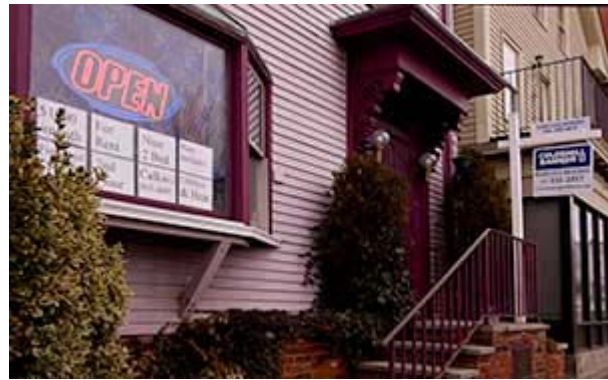
Fuji Spa open sign is still on and the house is up for sale