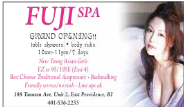
Advertisement from the Providence Phoenix , January 2009