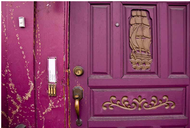
Front door of 417 Atwells Ave. The white buzzer in the upper left hand corner is marked "SPA."

The Fuji Spa has caused many problems for women on the same block. Two legitimate businesses are commonly mistaken for the brothel. An upscale beauty salon next door that offers legitimate massage