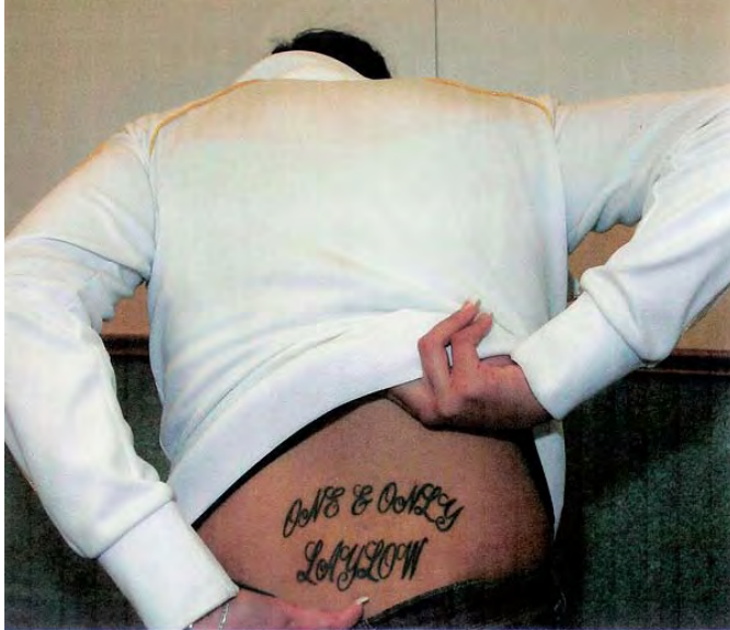
"One and Only Lay Low"