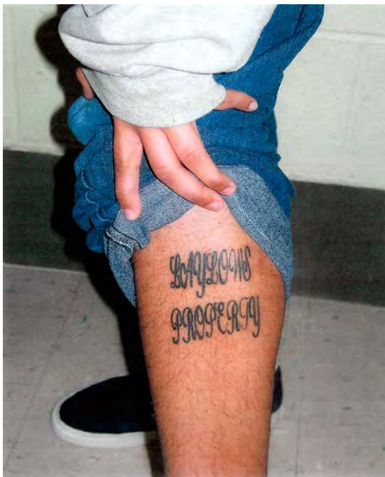
"Lay Lows Property"